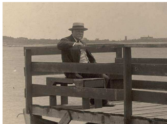
W. D. Howells