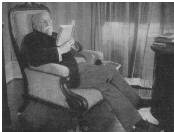
W. D. Howells at 75