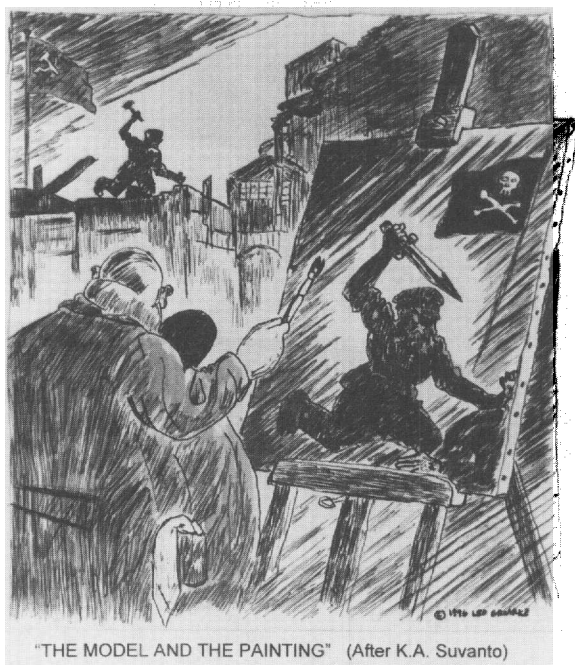
Figure 2. "The Model and the Painting," (After K. A. Suvanto).

bent on violence and repression distort the facts; they themselves are greedy and self-interested capitalists. Taken together, these claims lead to the obvious conclusion that we should not listen to those who attack the new Soviet experiment.