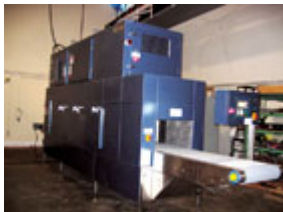
Engineers from England's Strayfield Ltd. installed this RF unit at Diamond Foods to test radio frequencies as an alternative to chemical fumigants in post-harvest nuts.

Commercialization of single-mode microwave units is at least two years away, and an element of technological risk remains. In the meantime, researchers at other firms are developing and refining commercial microwave systems. Microwave is still a technological baby, with considerable room for process improvement.