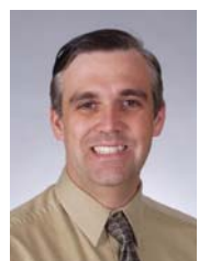
Dan Topping Anatomy