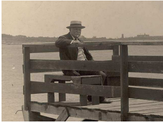
W. D. Howells