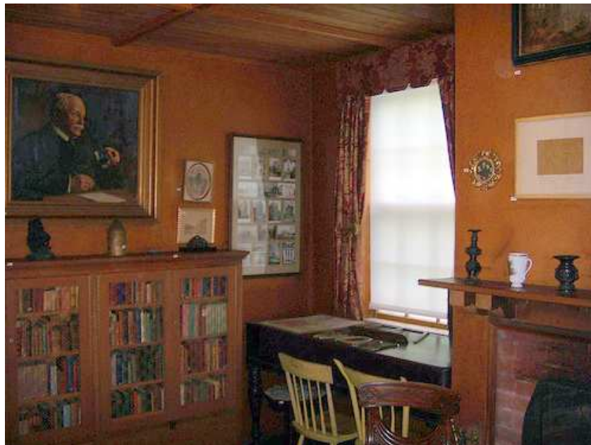
W. D. Howells's Study at Kittery Point, May 26, 2007.

Venetian Life could be defined as an autobiographical novel where the author reveals his ability to create inside his conscience a passage through which he can probe the mysteries of a civilization, of a story that is not found written in any book, but is directly told by the protagonists. Therefore, it is necessary for the author to turn everything into a written form, creating a type of surreal stage where, with different voices and different feelings, the characters reveal themselves to a distant public, as during the Carnival. Howells's characters keep their distance from the literary invention and use instead a real and appropriate language which gives truthfulness and topical interest to their eternal existence. They appear and disappear from the scene with discretion and elegance, under the wise guidance of the author, who lets them come into the scene and makes it appear as if he sees them for the first time as we do.