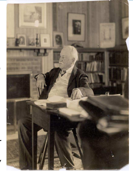
W. D. Howells in his study at Kittery Point