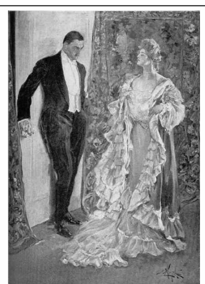
Fig. 2. I Mean to Make You

Institutional Support: Washington State University Kean University