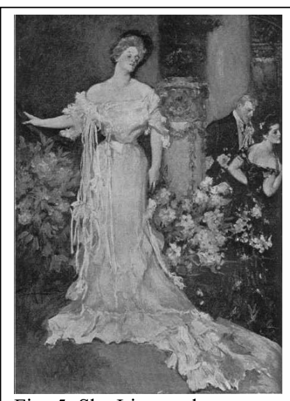
Fig. 5. She Lingered

Wenzell continues to utilize stair imagery in his other illustrations of the novel, just as Wharton returns repeatedly to visions of stairs to indicate the upward and downward social mobility of her characters. In "She Lingered," Lily stands on a landing looking down upon the party at Bellomont. Here