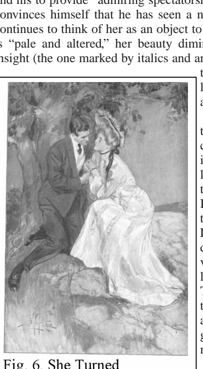
Fig. 6. She Turned

If Wharton wishes to emphasize Lily's inner complexity by juxtaposing it with Selden's shallowness, Wenzell misses the point entirely. Instead, he encourages the reader to misread Lily just as Selden had done by placing the viewer squarely in the latter's shoes. In "She Turned," Wenzell insists that the reader see Lily as an object of art to be gazed at and admired by He utilizes a men. (Continued on page 5)